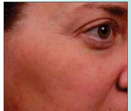
50 year old patient with uneven skin tone before Tx