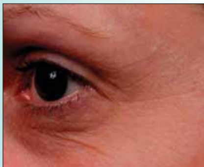
49 year old patient with fine periocular wrinkles before Tx

“The aim is to further enhance rejuvenation by jumpstarting the production of new collagen.”