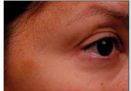
51 year old patient with hyperpigmentation before Tx