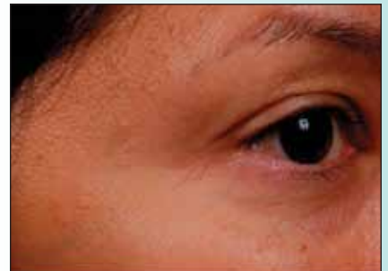
51 year old patient three months after use of TNS Essential Serum