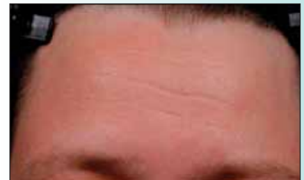
40 year old patient with coarse wrinkles before Tx

"I consider this product to be the gold standard in topical facial rejuvenation. In just one combination formula we have the essential ingredients to successfully stimulate the skin to reverse the effects of aging."