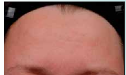
40 year old patient one month after use of TNS Essential Serum